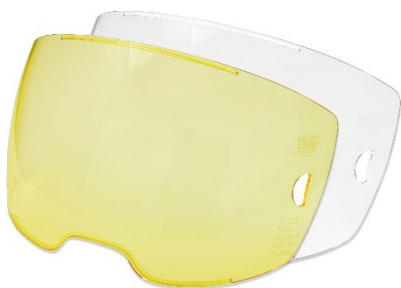
HD Front Cover Lens