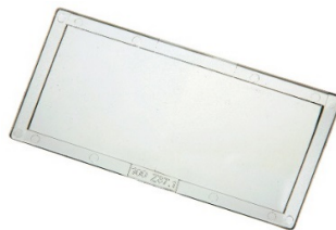
Magnifying Diopter Lens