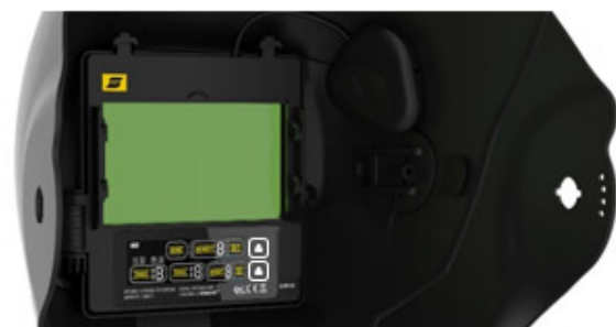
High optical class ADF, with colour touch screen interface