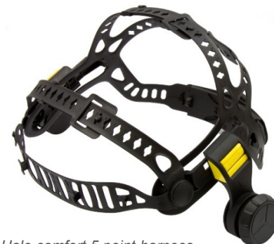
Halo comfort 5 point harness (Front view)